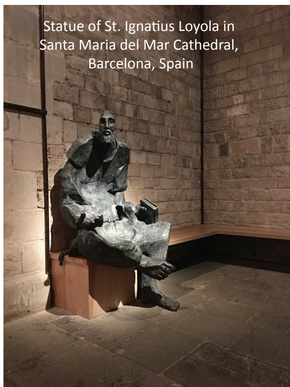
Statue of St. Ignatius Loyola in Santa Maria del Mar Cathedral, Barcelona, Spain

July 30, 2017 | Seventeenth Sunday in Ordinary Time