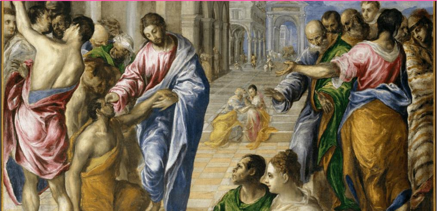
Christ Healing the Blind (detail) – El Greco (1541-1614)

March 19, 2023 | The 4th Sunday of Lent (A)