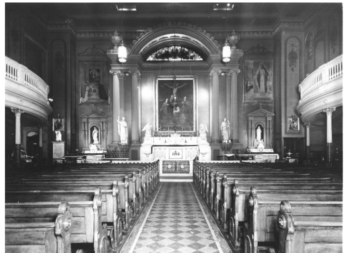
Old St. Joseph's interior — 1940s

For Text-to-Give (215-929-7151) the keywords are RiceBowl, LatinAmer, EasterFlowers, EasterMusic, HolyThur, GoodFri, and Easter