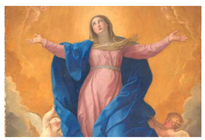
The Assumption of the Blessed Virgin Mary A Holyday of Obligation Tuesday, August 15, 2023 Mass at 12:05 PM only