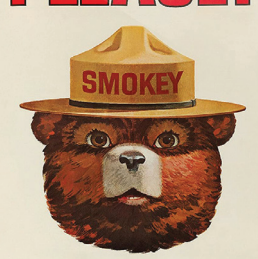
Only you can prevent forest fires