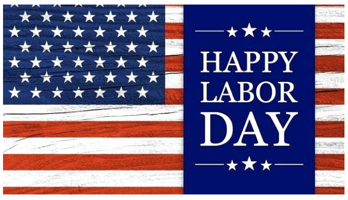
In observance of Labor Day, the rectory offices will be closed on Monday, September 4, 2023. Enjoy the holiday weekend!