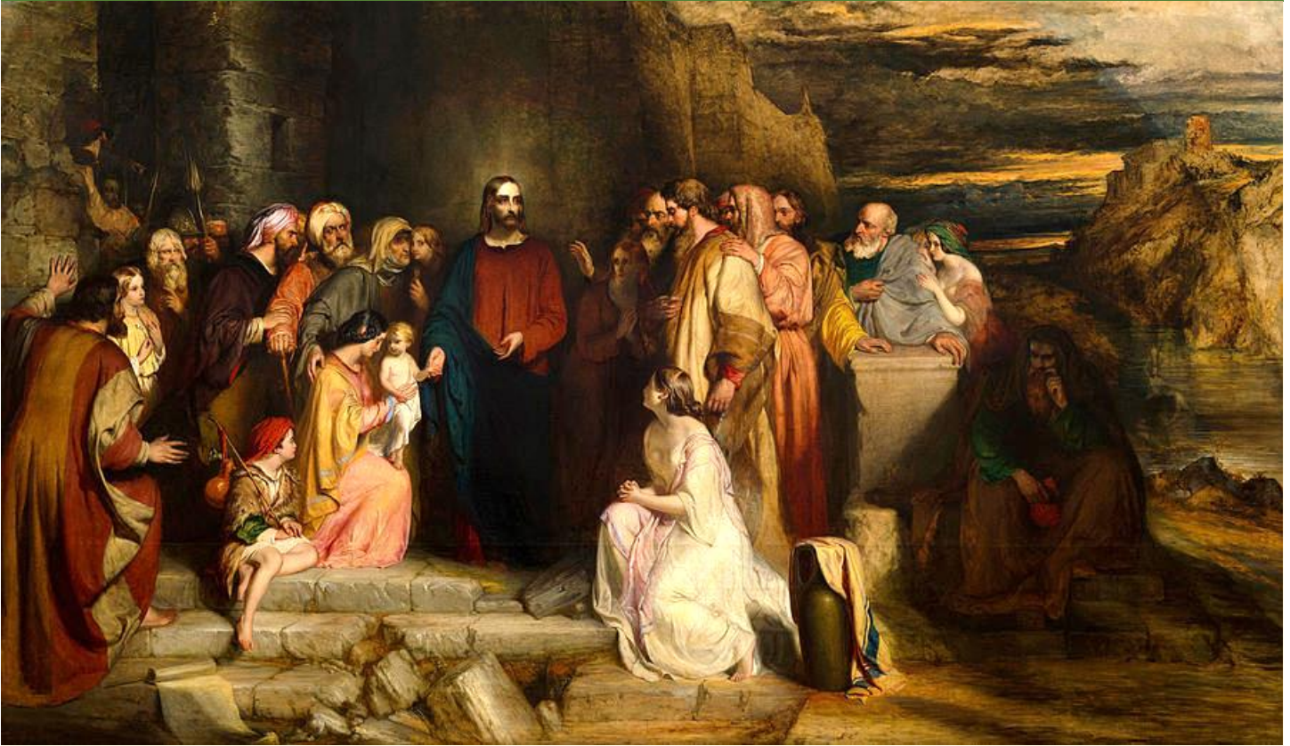
Christ Teacheth Humility – Robert Scott Lauder (1803-1869)

November 5, 2023 | The 31st Sunday in Ordinary Time (A)