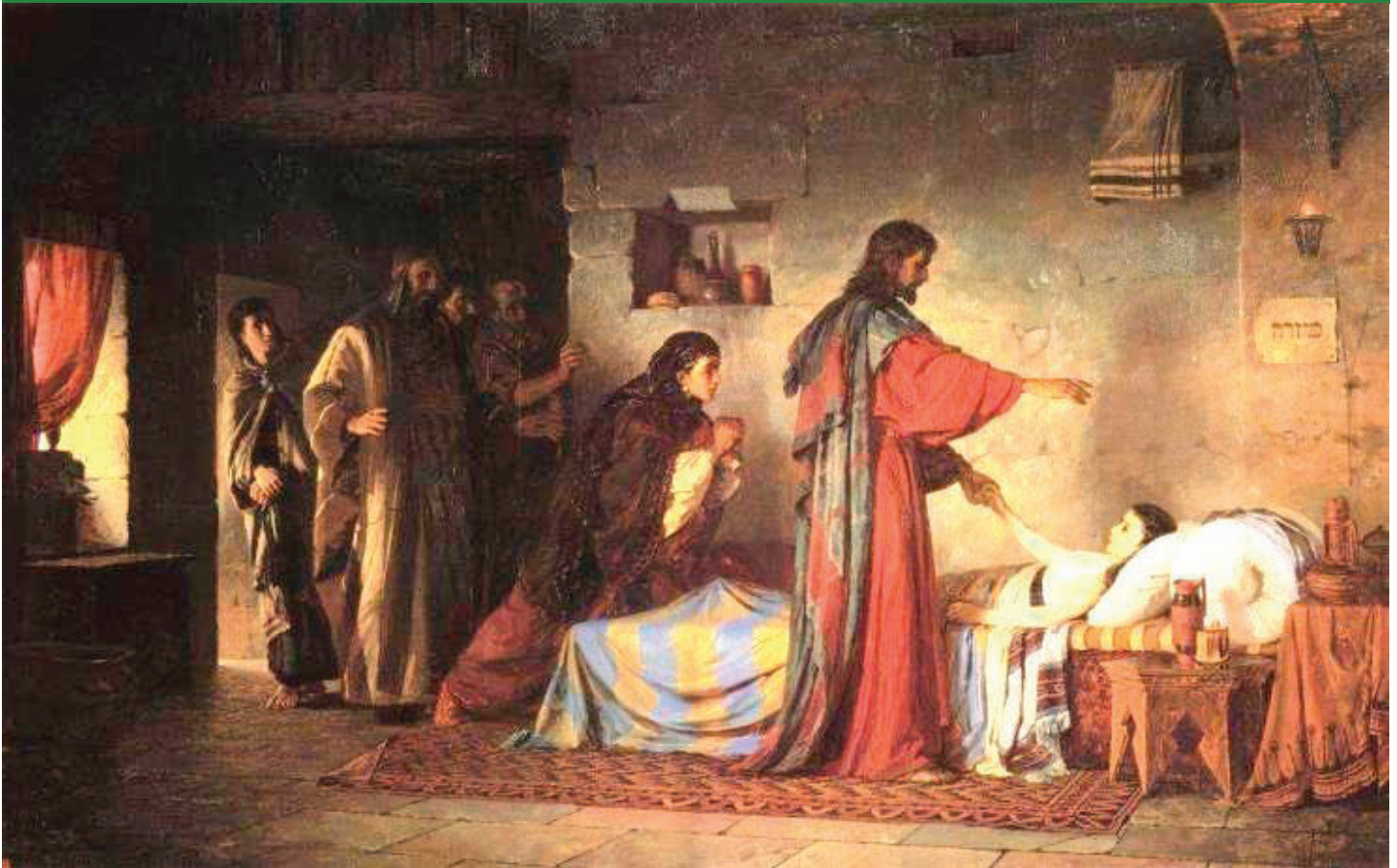
The Resurrection of Jairus' Daughter (1871) – Vasily Polenov (1844–1927)

June 30, 2024 | The 13th Sunday in Ordinary Time (B)