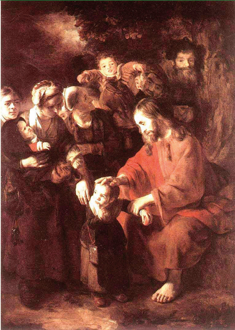
Christ Blessing the Children – Nicolaes Maes (1634-1693)

September 22, 2024 | The 25th Sunday in Ordinary Time (B)