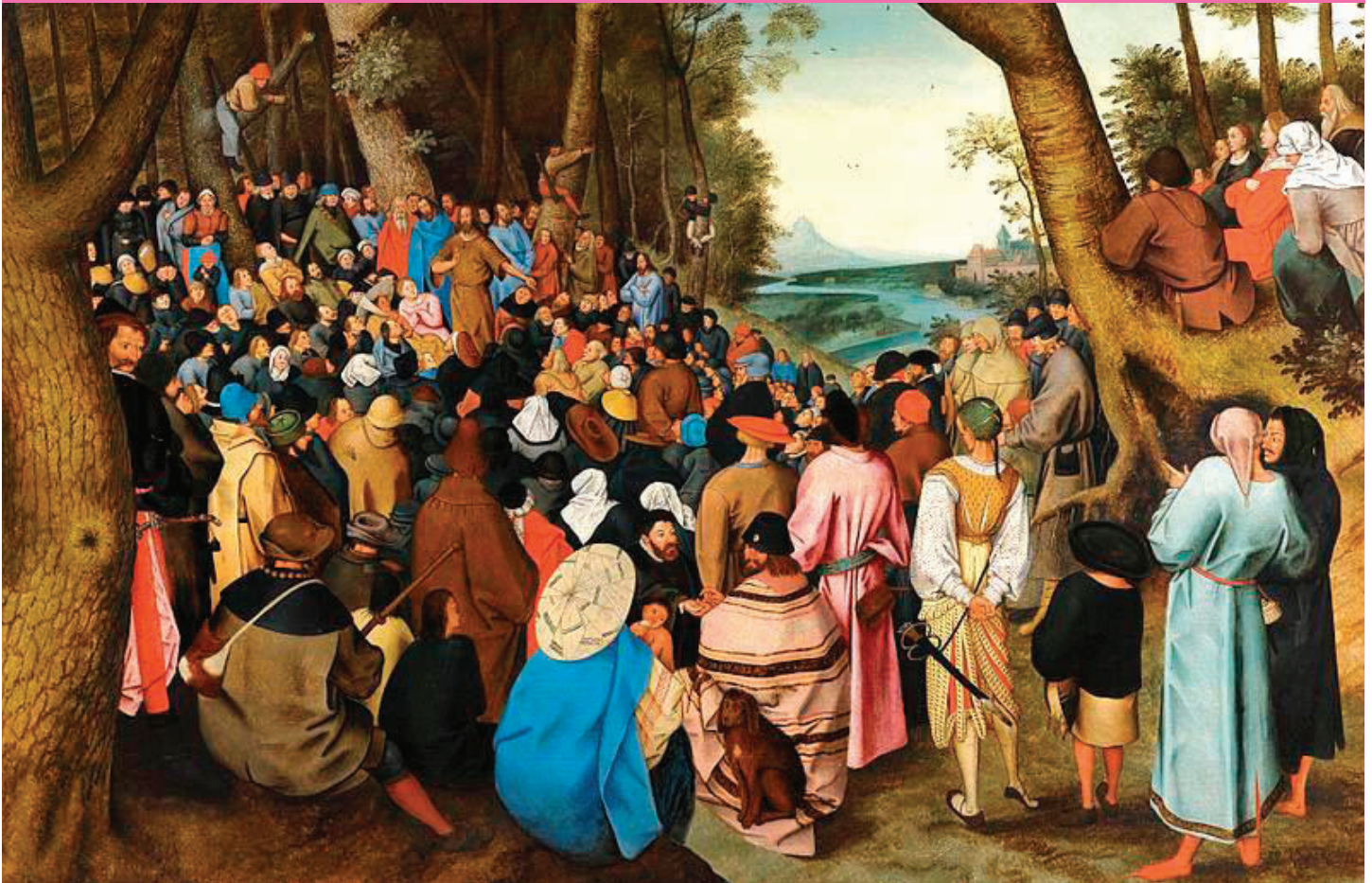
Saint John the Baptist Preaching to the Masses in the Wilderness - oil on oak panel by Pieter Brueghel the Younger

December 15, 2024 | The Third Sunday of Advent (C)