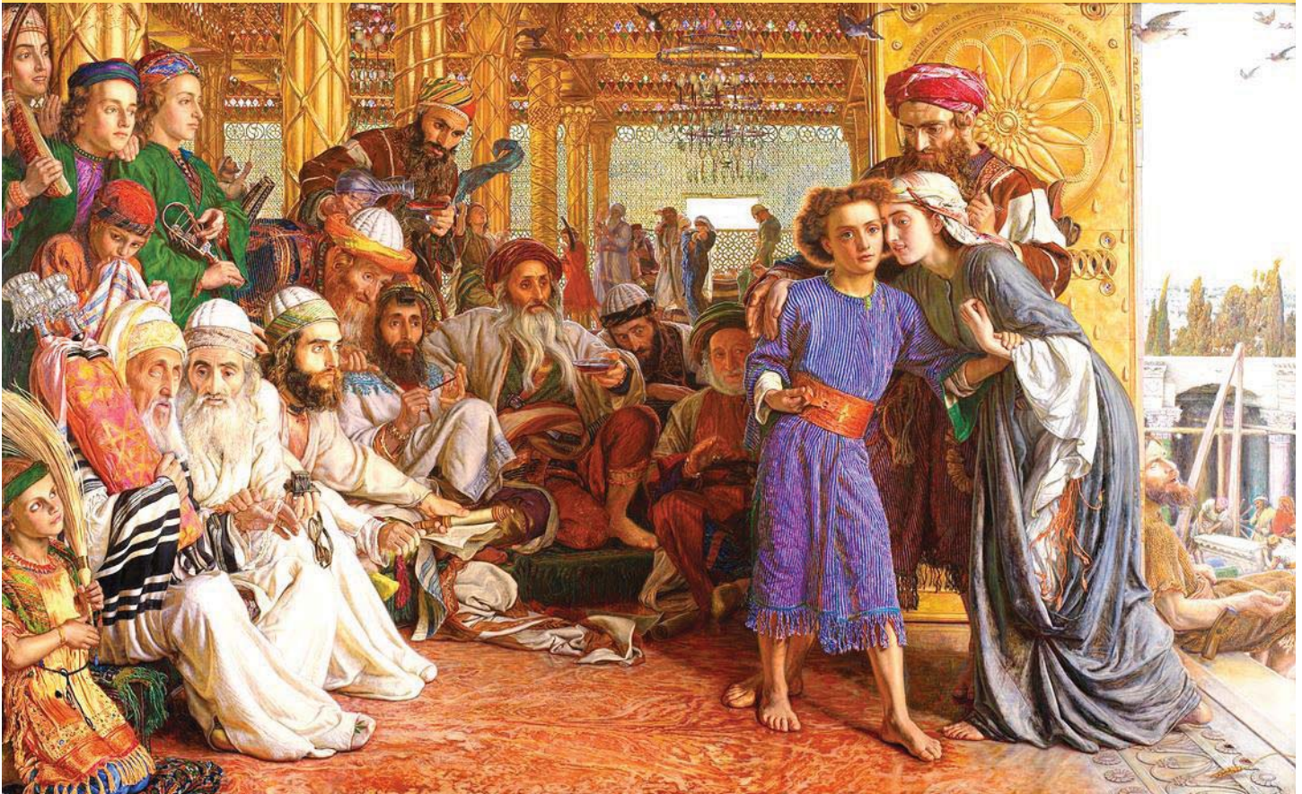
The Finding of the Saviour in the Temple (1860) – William Holman Hunt (1827-1910)

December 29, 2024 | Feast of the Holy Family of Jesus, Mary and Joseph