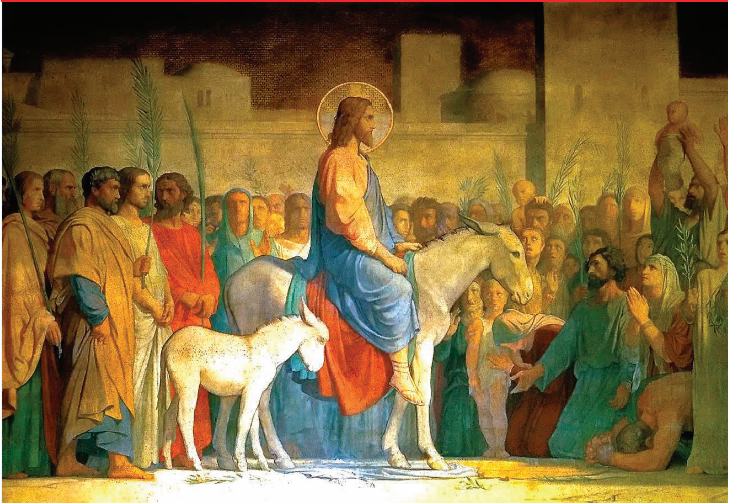
Jesus Riding into Jerusalem, fresco (1842-48) – Jean-Hippolyte Flandrin

April 13, 2025 | Palm Sunday of the Passion of the Lord (C)