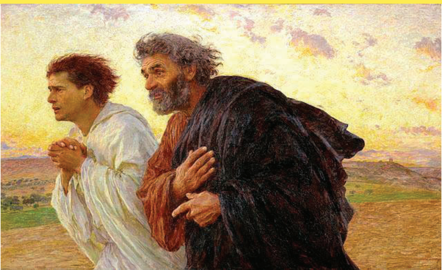
The Disciples Peter and John Running to the Sepulchre on the Morning of the Resurrection—Eugène Burnand, Musée d'Orsay

April 20, 2025 | Easter Sunday of the Resurrection of the Lord