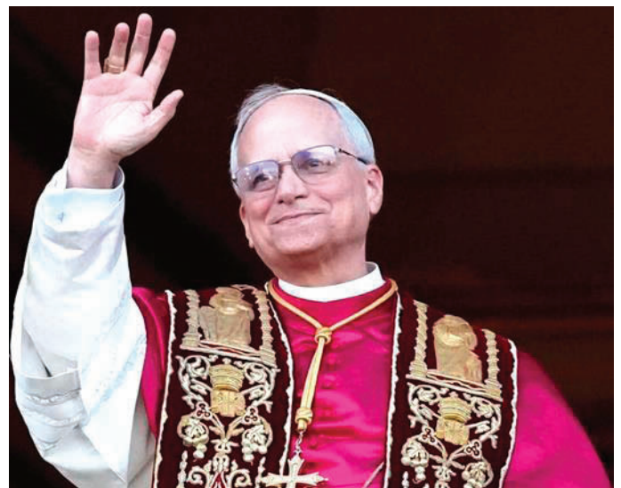
His Holiness Pope Leo XIV

The average weekly collection this April was $9,182.66, an increase of $1,063.41 per week over fiscal year 24. Thank you for your increased generosity to Old St. Joseph's!